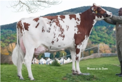
THOS APOLL ALUMETTE P RED ET Ramadería Can Thos, S.L. - Barcelona