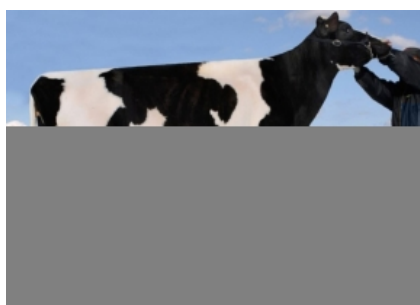
BELFAST BOLTON SUPRA