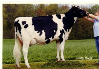
KINGS-RANSOM DB DIGITAL ET