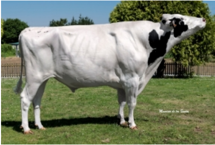
GRILLE MCC CINDER FIV HAPPY ET Grille S.Coop.Galega - A Coruña