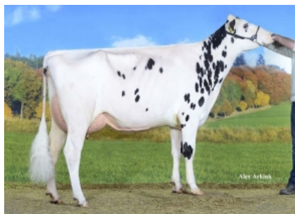
JK DG CINDERE ET