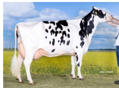
GIESSEN CINDERELLA 15 ET