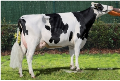
CUNDINS CINTIA RUBICON Granxa Cundin, S.L. - A Coruña