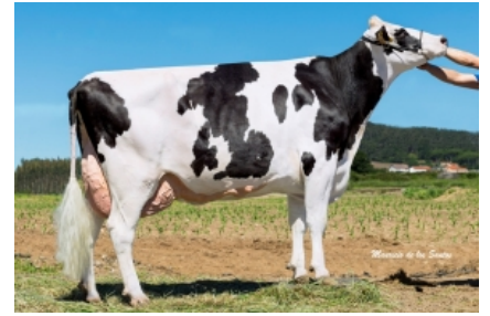
CUNDINS CINDEROXY KINGBOY ET Granxa Cundin, S.L. - A Coruña