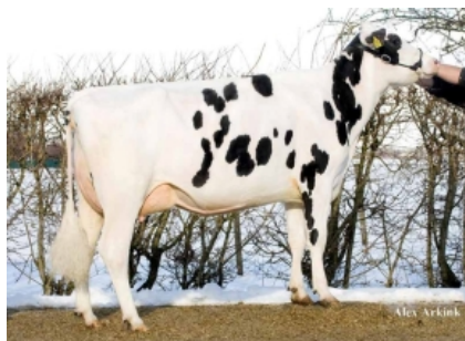
GIESSEN CINDERELLA 20 TY ET