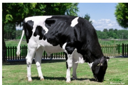
DG 5077 FUSSION ET