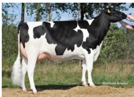
WEH BRASILIA ET