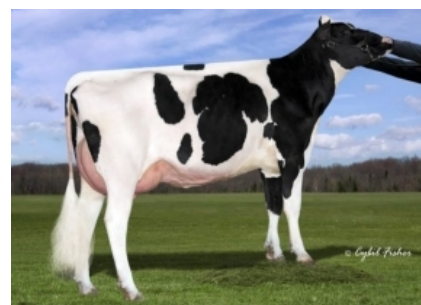
SIEMERS RUBICON D-ROZZA ET