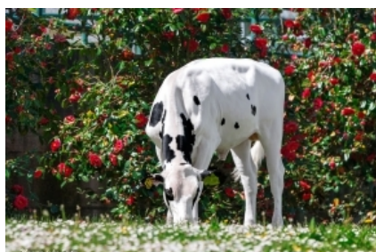
K&L OH ROSSI GUAY