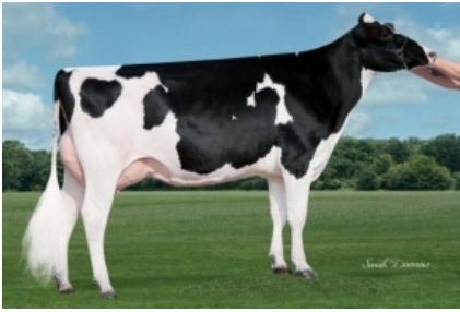
SIEMENS DOORMAN ROZ ET