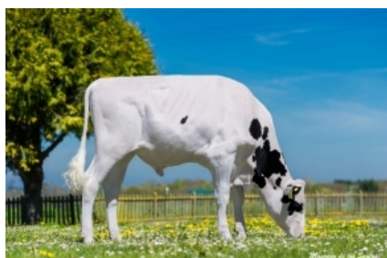
K&L OH ROSSI GUAY