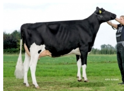
DG JK EDER SILLY