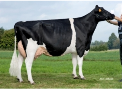
ALL NUREBAXTER SILVY ET