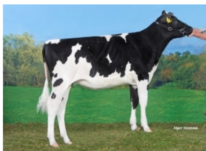
DG JK SIMMY